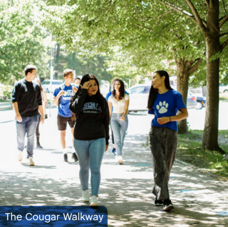
The Cougar Walkway