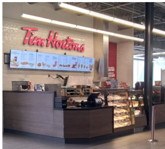
10. Find your ice cap, donut and quick treat, this is the place you want to meet. Building: Sport Plex