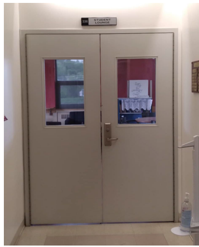
8. Need a break between classes? This cozy spot is perfect for relaxing, chatting, or grabbing a snack! Building: Champlain Building