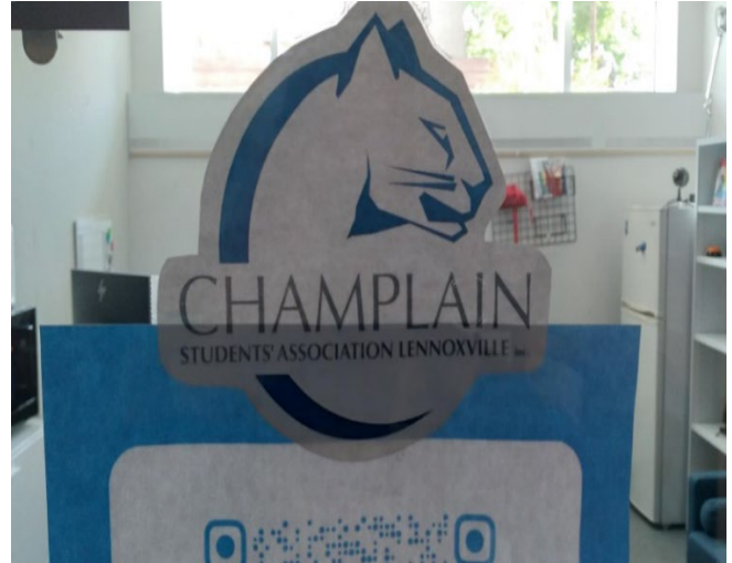
3. We organize activities, we are the connection between you and the College Administration, we are here to defend your rights and be part of your success. Building: Bishop's Student Center