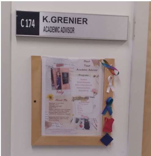
6. The person who helps you navigate your journey — find your academic advisor's space! Building: Champlain Building