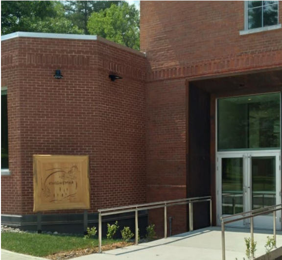
1. The name that means this place belongs to all, welcoming everyone inside, find the place where we share the house