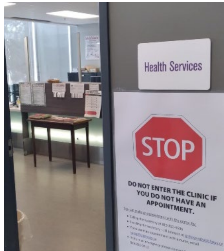
9. Feeling sick or needing a checkup? Find the place where health comes first. Building: Sport Plex