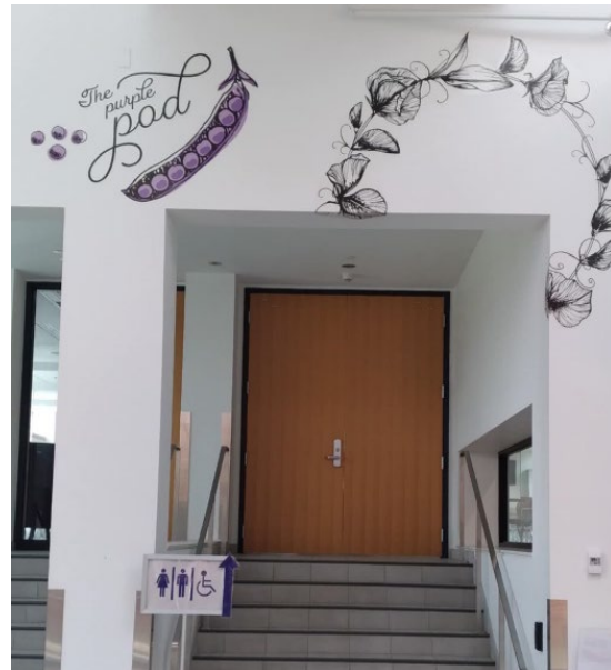
4. Let's grab a bite between classes; find a place to have lunch with your friends. Building: Bishop's Student Center