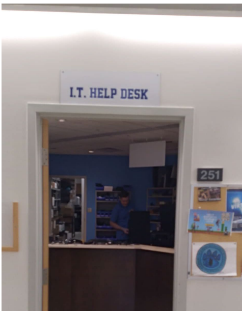
7. Need to fix your tech problem? Our experts are here to help you. Building: Champlain Building.