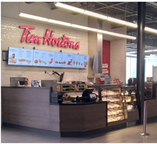
5. Find your ice cap, donut and quick treat, this is the place you want to meet. Building: Sport Plex