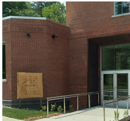
10. A name that means this place belongs to all, welcoming everyone inside, find the place where we share the house