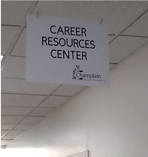
1. For questions about university and careers. Find the office where your future takes shape. Building: Champlain Building