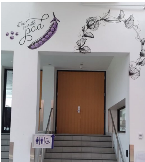
7. Let's grab a bite between classes, find the place to have lunch with your friends. Building: Bishop's Student Center