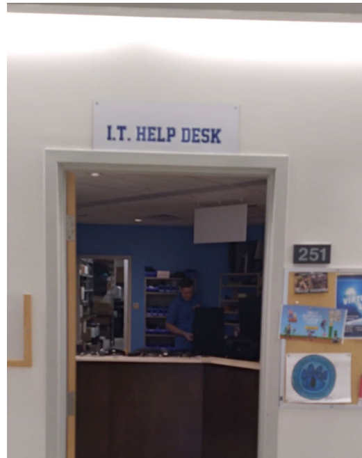
3. Need to fix your tech problem? Our experts are here to help you. Building: Champlain Building.