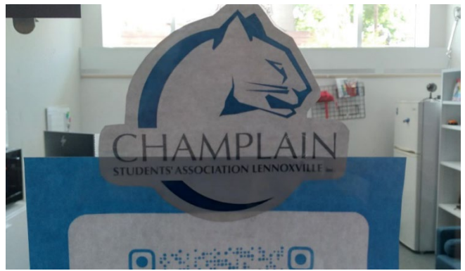
8. We organize activities, we are the connection between you and the College Administration, we are here to defend your rights and be part of your success. Building: Bishop's Student Center