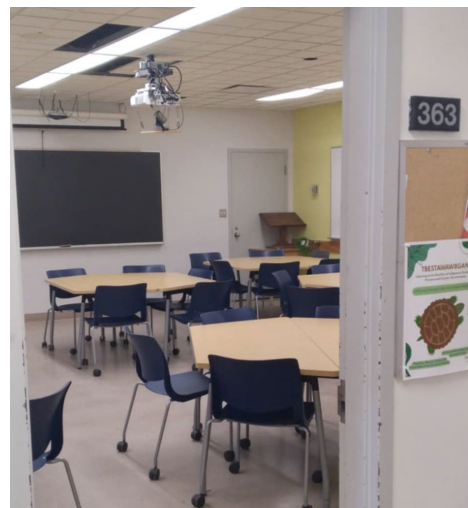
4. This is where future helpers learn how to support people with different needs — from children to seniors! Building: Champlain Building