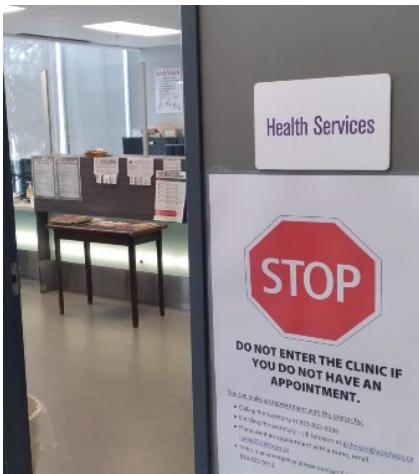
6. Feeling sick or needing a checkup? Find the place where health comes first. Building: Sport Plex