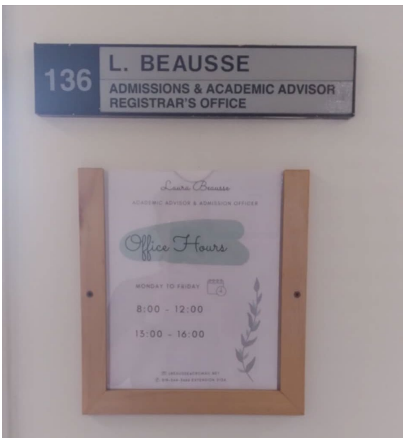
2. The person who helps you navigate your journey — find your academic advisor's space! Building: Champlain Building