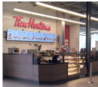
10. Find your ice cap, donut and quick treat, this is the place you want to meet. Building: Sport Plex