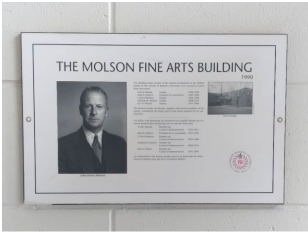
5. The place where your creativity comes to life, one brushstroke at a time. Building: Molson Fine Arts