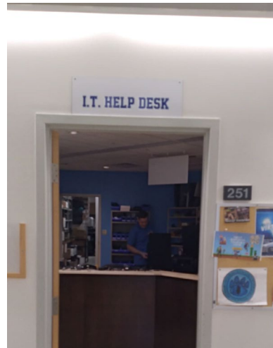
8. Need to fix your tech problem? Our experts are here to help you. Building: Champlain Building.