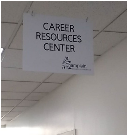
6. For questions about university and careers. Find the office where your future takes shape. Building: Champlain Building