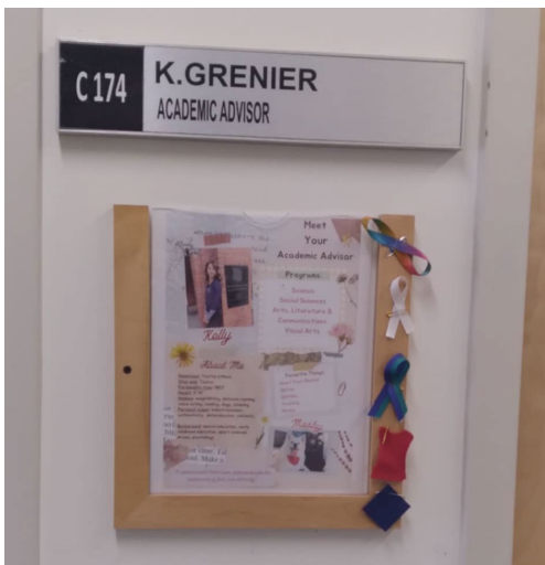
7. The person who helps you navigate your journey — find your academic advisor's space! Building: Champlain Building