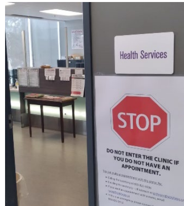
9. Feeling sick or needing a checkup? Find the place where health comes first. Building: Sport Plex