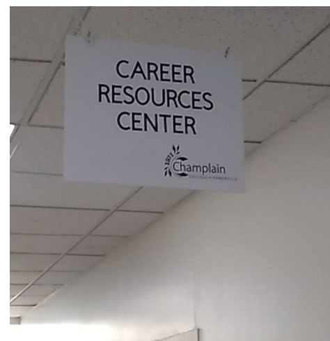
4. For questions about university and careers. Find the office where your future takes shape. Building: Champlain Building