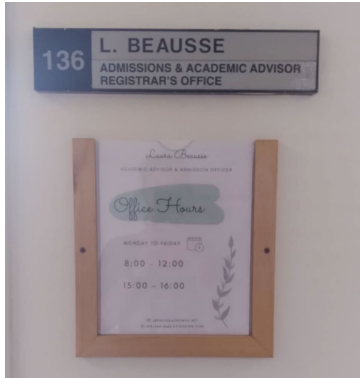
1. The person who helps you navigate your journey — find your academic advisor's space! Building: Champlain