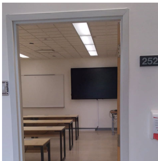
2. The place where ideas are turned into programs. Can you locate the tech hub? Building: Champlain